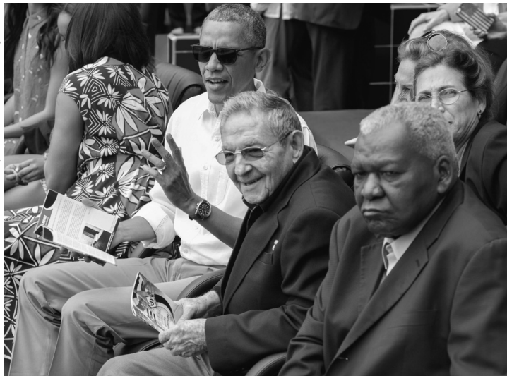
U.S. President Barack Obama sits with Cuban President Raul Castro at the Estadio Lationamericano in Havana, Cuba, on March 22, 2016, for an exhibition game between the Cuban National Baseball Team and the Tampa Bay Rays.

Source: US Department of State, wikimedia.org/47096471